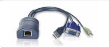
Example CAM: CATX-USB

CAM: Computer Access Modules: CATX-PS2 (PS/2 only) CATX-USB (USB only) CATX-SUNA (Sun plus audio) CATX-CONSOLE (Terminal server)