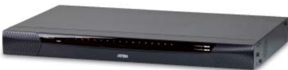
KN1116v front view