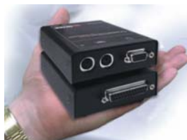
Small in size, loaded with features

The Serial/Audio model allows stereo audio to be transmitted in either direction across the CAT5 link simultaneously. Many serial devices like a Touchscreen can plug directly into the serial port on the Remote Unit. The Mini model is small in size but loaded with state of the art technology. It is ideal for extending the distance between a CPU and a KVM station (up to 150 feet).