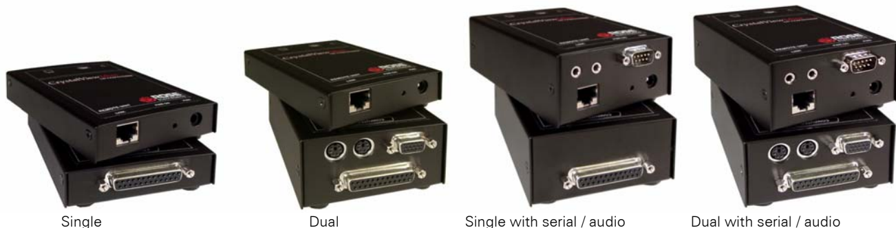
Rearview of all CrystalView Mini models