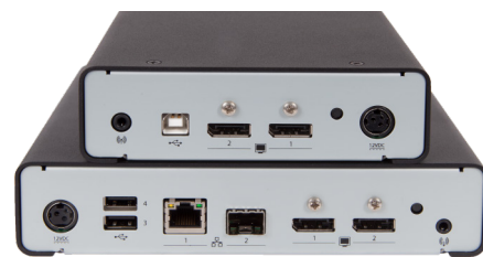
ADDERLink INFINITY 2102 TX & RX - Rear