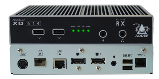
ADDERLink XD614 RX - Front & Rear

CAT6 is recommended for CATx extensions. CATx extensions are limited to 2 patch connections. Patch cables should be CAT6 or better.