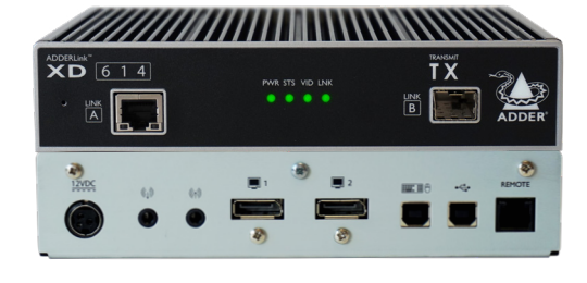
ADDERLink XD614 TX - Front & Rear