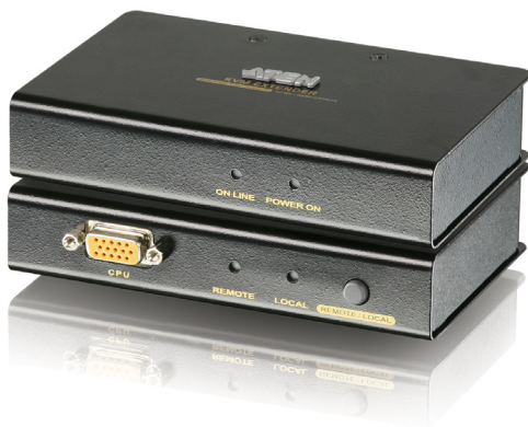
CE250AR (Remote unit)