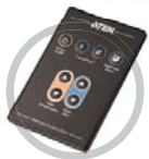
IR Remote Control Included