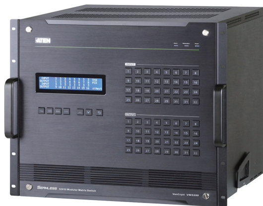
VM3200 Front view