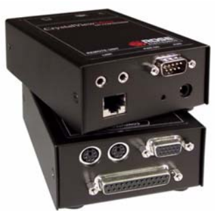
Single with serial / audio